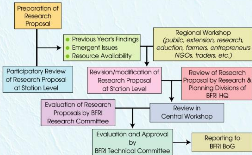
Fig. 3. Flow Chart of Research Planning Process.