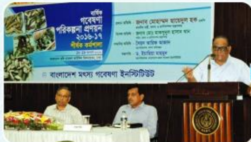
Hon'ble Minister for MoFL Inaugurating Workshop on Bfri Annual Research Plan (2016-2017)

Research activities of the institute tends to develop the fisheries sector by generating suitable and modern aquaculture technologies for better management of aquatic resources and increase fish production. The institute organizes series of well structured training programs every year to disseminate the research evolved technologies to the extension agencies and end users. The main objective of offering such type of need and opportunity based training is to transfer and disseminate technologies among various stakeholders and end users. During last five years a total of 375 training batches were completed and 7658 nos. of people were trained by the Institute.